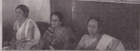
■ মহিলা-শিশু উন্নয়ন কর্মশালাৰ এটি মুহূৰ্ত

"PROMOTING THE ABOUT WOMEN • CHILD DEVELOPMENT AMONG COMMUNITY • ICDS WORK DISTRICT COMMUNITY DEVELOPMENT D.C.C.P. CONFERENCE HALL SHELUDANGA • SONITPUR.