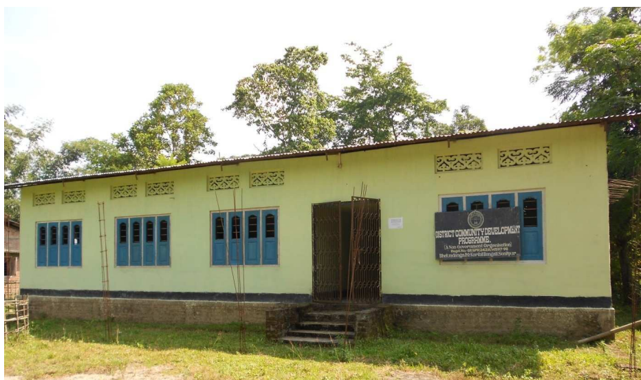
DCDP Office Building at Bheluadanga